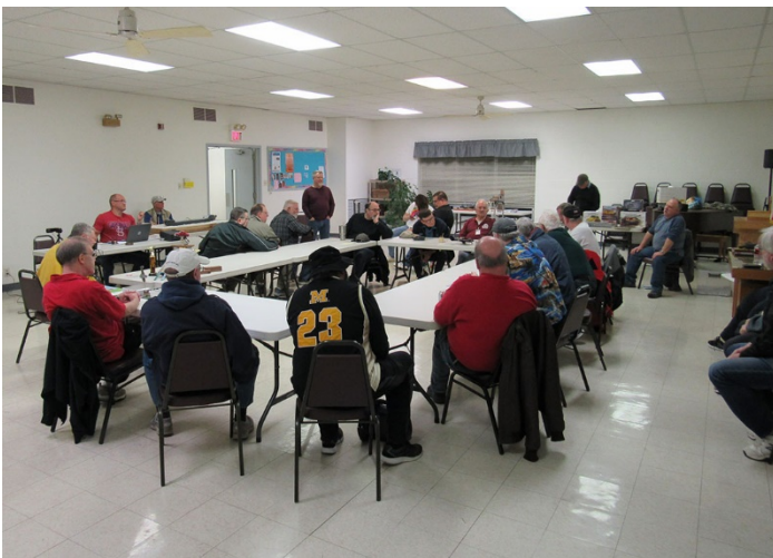
Members sat beside tables where some Show and Tell items were placed.