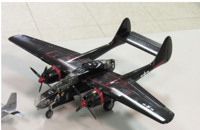
A third McShea completed model was this Great War 1:48 P-61B Black Widow.