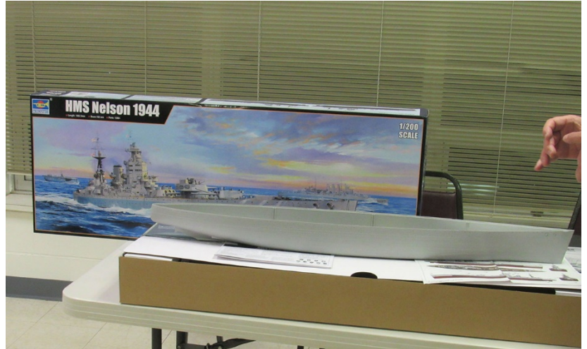
Jim Victor brought in Trumpeter's 1:200 HMS Nelson 1944 kit.