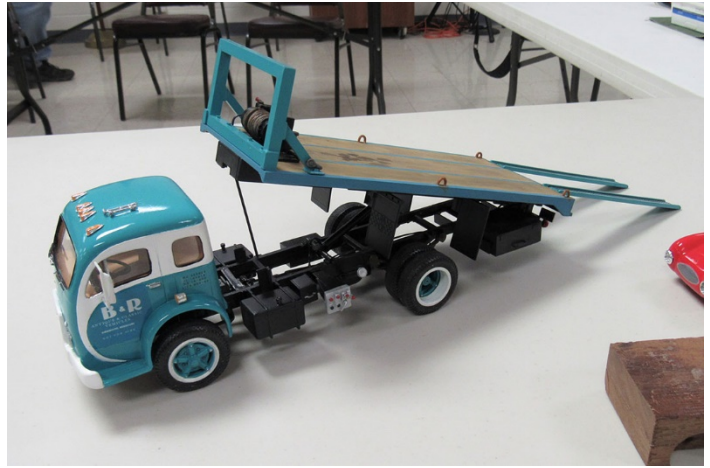
Roeder also brought in this 1:25 White cab over engine truck.